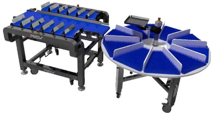
ULTRA-GENTLE SANITISABLE (IP65)